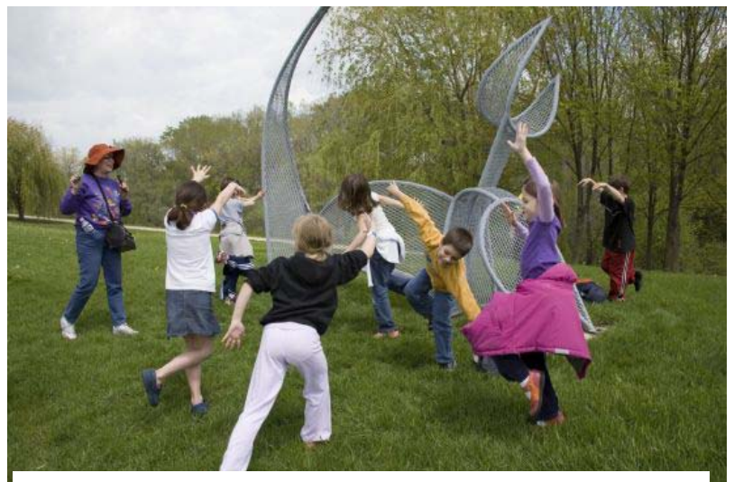
A group of students enjoys the Ted Garner sculpture Baile de Alacran during a school tour at the Sculpture Park.

In addition to the sculptures and amenities of the park itself, The Sculpture Park brings the experience of the sculptures to an expanded audience through educational programming. For the past four years, over two thousand public school children have participated in the Park's outreach program, Sculpture in the Classroom , completely free of charge. Typically, the program is presented in three parts. The first week, we visit the students at their school and show them slides of sculptures in the park, the second week the students tour a section of the Park and the third week we return to the school to lead the students in a hands-on art project. The projects are designed to fit into the curriculum such as geometry, poetry, nature and aesthetics.