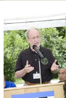
Mayor George Van Dusen